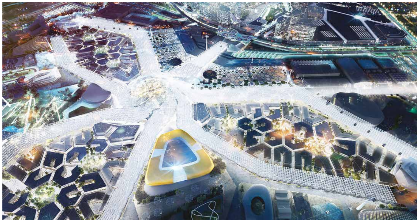
RLB: Expo 2020 Dubai. The United Arab Emirates will host the World Expo in Dubai in 2020. This is the first time that World Expo will be held in MEASA. Dubai's World Expo theme of Connecting Minds, Creating the Future and is expected to attract 25 million visits, 70% will be overseas