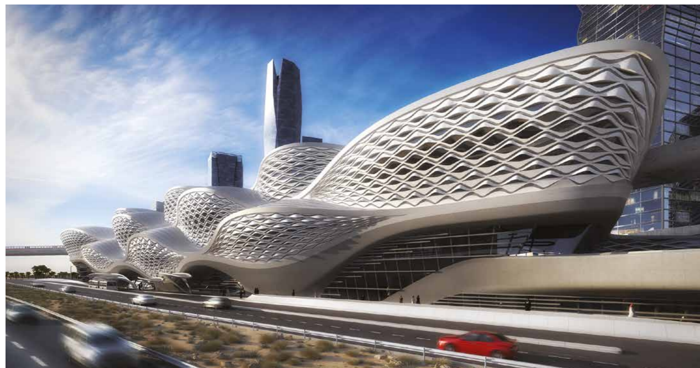
ZAHA HADID ARCHITECTS: King Abdullah Financial District Metro Station, Riyadh. With a population of more than five million, the capital Riyadh is Saudi Arabia's biggest city and is experiencing rapid growth. The façade patterning reduces solar gain while its geometric perforations contextualise the station within its cultural environment. The overall composition resembles patterns generated by desert winds in sand dunes