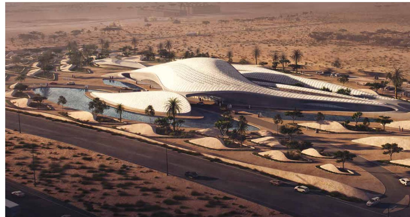
ZAHA HADID ARCHITECTS: Bee'ah Headquarters, Sharjah, UAE. The new Headquarters building is part of the Bee'ah's ongoing investment to transform attitudes and behaviours to support to achieve Zero-Waste to landfill targets. The Bee'ah School of Environment (BSOE) has hosted to date 174,000 children in over 210 schools across the emirate. Bee'ah Headquarters is LEED Platinum with ultra-low carbon and minimal water consumption

"Germany world's slowest growing construction market to 2030"