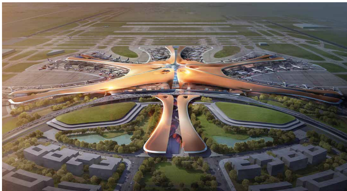
ZAHA HADID ARCHITECTS: Beijing New Airport Terminal Building, Daxing, Beijing, set to become the world's largest airport passenger terminal

the UK economy forward, if they are implemented. Projects include the new GBP50bn High Speed 2 rail connection from London to Birmingham with onward connection with Manchester and Leeds.