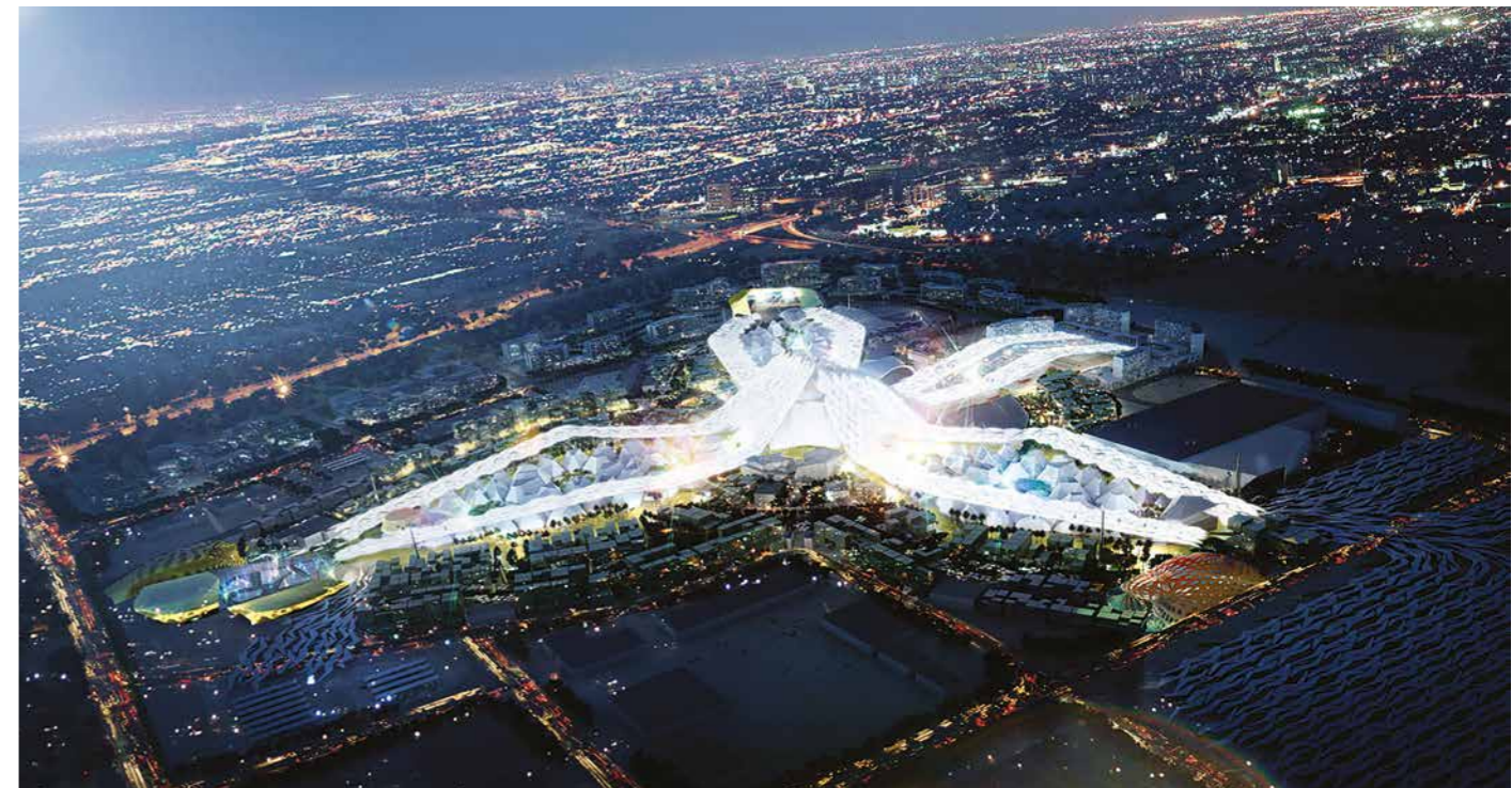
RLB: Expo 2020 Dubai. The United Arab Emirates will host the World Expo in Dubai in 2020. This is the first time that World Expo will be held in MEASA. Dubai's World Expo theme of Connecting Minds, Creating the Future and is expected to attract 25 million visits, 70% will be overseas

The US and Canada are also constrained, not because they are over-reliant on oil extraction as a source of economic activity and government revenues, but because the costs of extraction are higher than in most other regions. In the US, investment in mining exploration, shafts and wells has plummeted by 35% since the end of 2014. But innovation is driving down extraction costs, which will amplify the recovery when