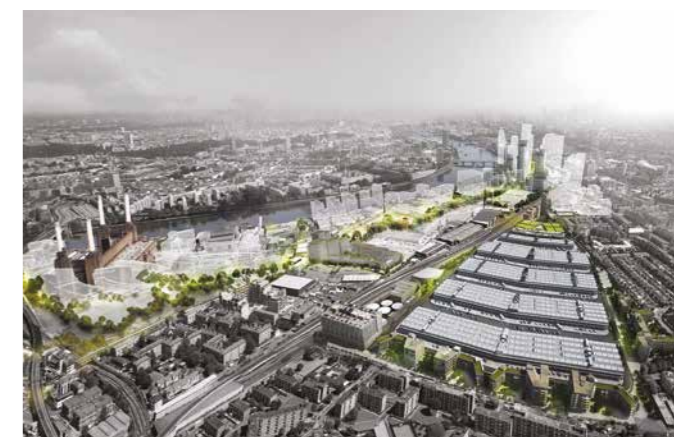
Nine Elms on the South Bank, will be one of London’s greatest transformations, becoming an ultra-modern complex offering 16,000 homes and 25,000 jobs, schools, parks, culture and the arts, set over 196 hectares including the iconic Battersea Power Station