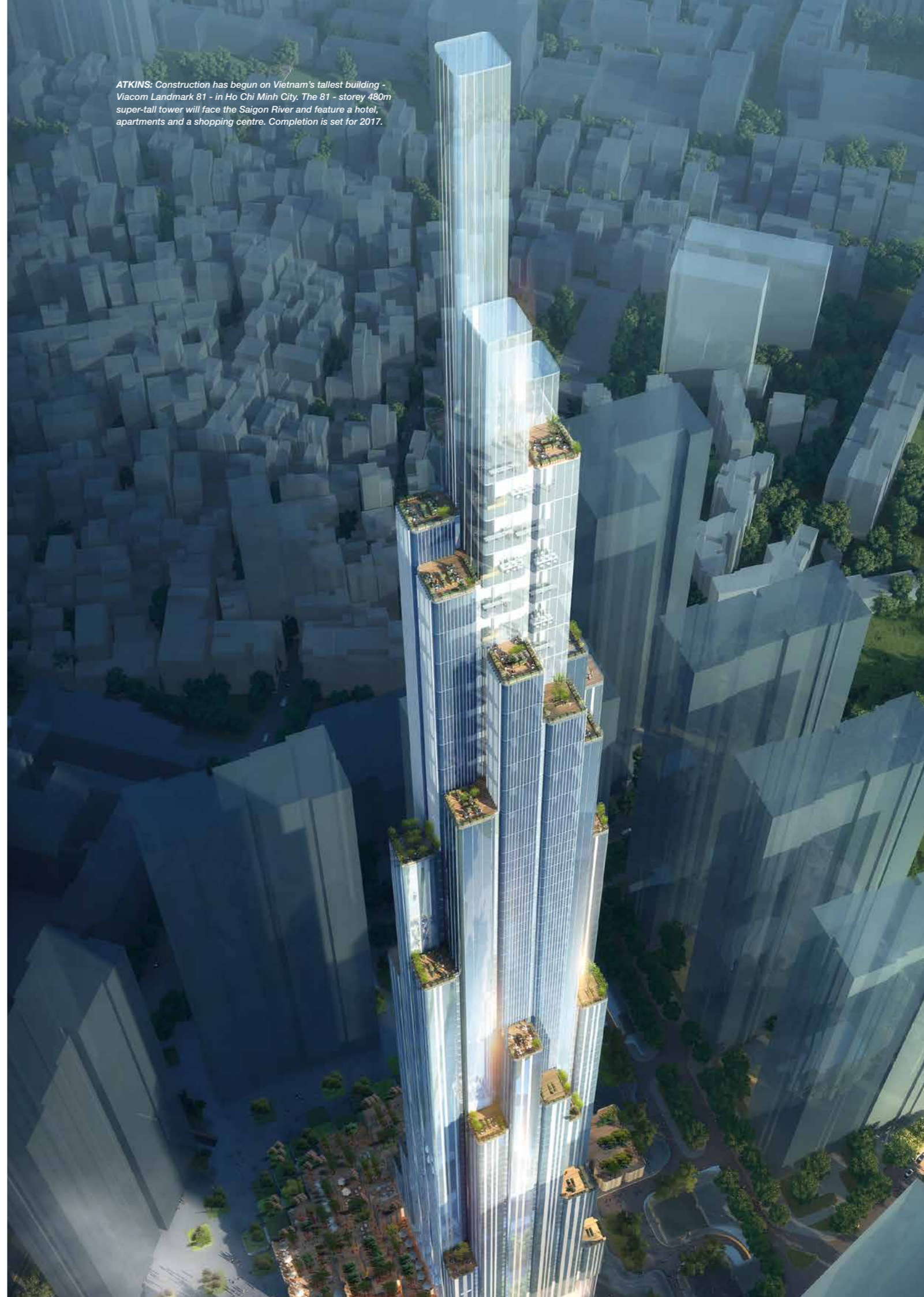
ATKINS: Construction has begun on Vietnam's tallest building - Viacom Landmark 81 - in Ho Chi Minh City. The 81 - storey 480m super-tall tower will face the Saigon River and feature a hotel, apartments and a shopping centre. Completion is set for 2017.