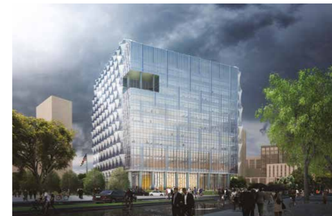
US embassy in Nine Elms, Battersea. The 11 storey cube-shaped building, one of the highest performing energy use and sustainability in the world