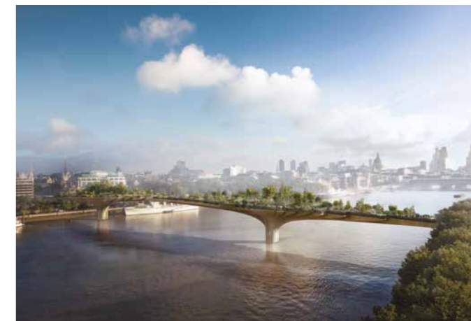
ARUP: Garden Bridge, London. The Garden Bridge is a proposed pedestrian bridge over the River Thames, sitting between Waterloo Bridge and Blackfriars Bridge. Conceived by the actress Joanna Lumley, the bridge will feature trees and plants stretching over 367 metres, 30 metres wide and costing approximately GBP175 million to build and around GBP3 million a year to run

Britain’s proposed mega projects are on a scale not seen for decades within the UK (except for the recent Crossrail project), and will help propel